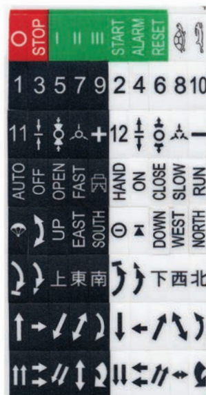
Part No. 52767

Please refer to Appendices I and II for details of radio options.